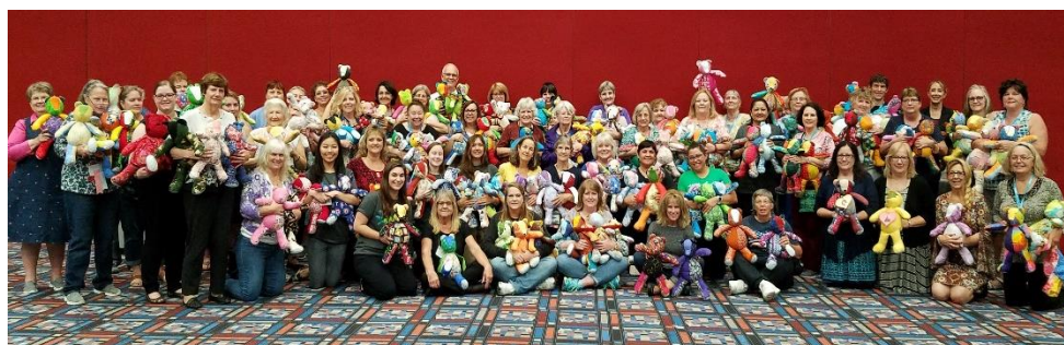
A very successful bear stuffing party! Over 200 bears were completed. Thank you RARE Bear Army!